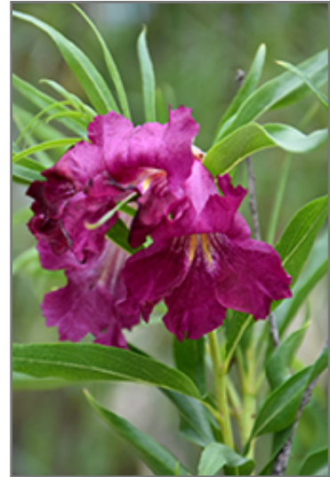
Sweet Katie Burgundy Desert Willow flowers