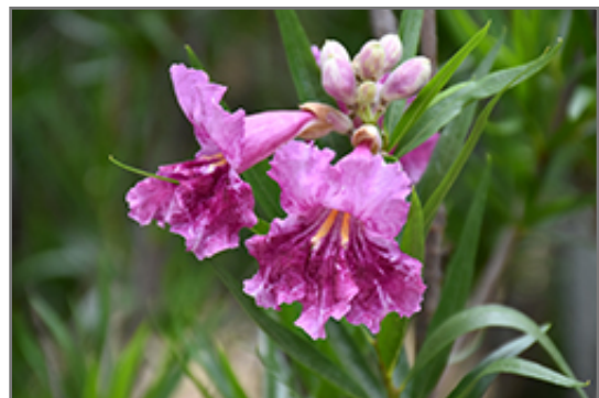
Bubba Desert Willow flowers