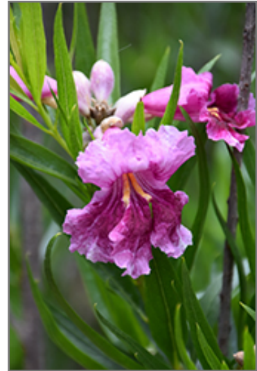
Bubba Desert Willow flowers