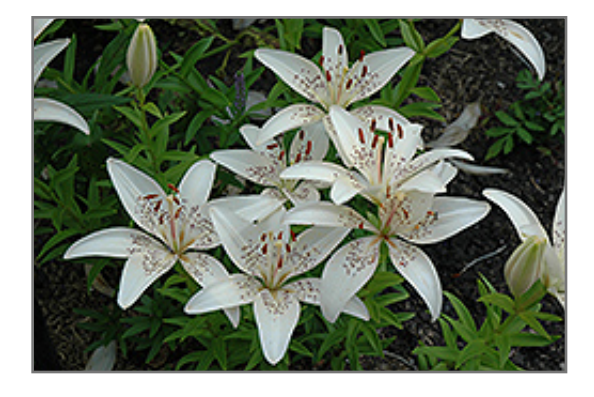
Matterhorn Lily flowers

Matterhorn Lily will grow to be about 16 inches tall at maturity, with a spread of 12 inches. When grown in masses or used as a bedding plant, individual plants should be spaced approximately 10 inches apart. It grows at a fast rate, and under ideal conditions can be expected to live for approximately 10 years. As an herbaceous perennial, this plant will usually die back to the crown each winter, and will regrow from the base each spring. Be careful not to disturb the crown in late winter when it may not be readily seen!