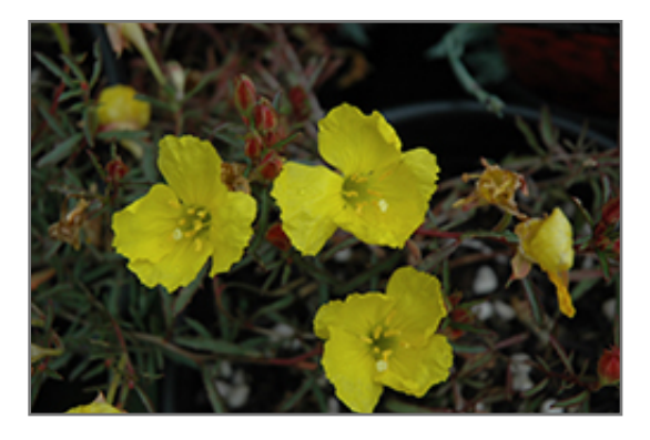
Prairie Lode Sundrops flowers