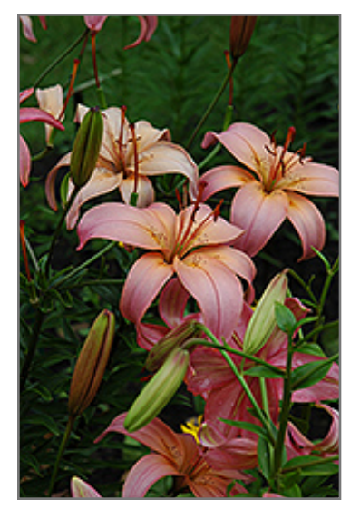
Mary Margaret Lily flowers

Mary Margaret Lily features bold pink trumpet-shaped flowers with yellow throats and brown spots at the ends of the stems in early summer. The flowers are excellent for cutting. Its narrow leaves remain green in colour throughout the season.