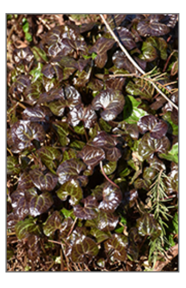
Ginger-leaf False Bugbane foliage

Ginger-leaf False Bugbane's attractive glossy heart-shaped leaves emerge coppery-bronze in spring, turning dark green in colour with distinctive light green veins on a plant with a mounded habit of growth. As an added bonus, the foliage turns a gorgeous plum purple in the fall. It features dainty spikes of lightly-scented white flowers rising above the foliage from early to late summer.