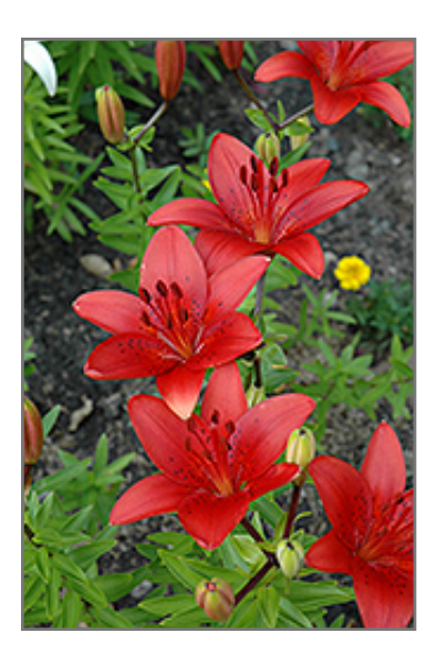
Lovelight Lily flowers

Lovelight Lily features bold red trumpet-shaped flowers with black spots at the ends of the stems in early summer. The flowers are excellent for cutting. Its narrow leaves remain green in colour throughout the season.