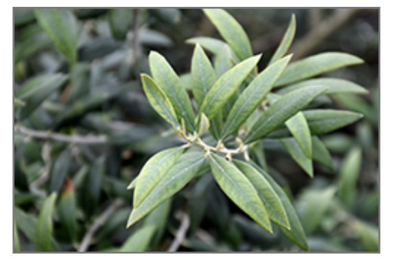
Haas Improved Manzanillo European Olive foliage

Haas Improved Manzanillo European Olive is bathed in stunning panicles of fragrant white flowers along the branches from late spring to early summer. The fruits are showy light green drupes which fade to brown over time, which are carried in abundance from mid summer to early fall. The fruit can be messy if allowed to drop on the lawn or walkways, and may require occasional clean-up. It has dark green foliage with grayish green undersides which emerges chartreuse in spring. The small glossy narrow leaves remain dark green throughout the winter. The smooth gray bark adds an interesting dimension to the landscape.