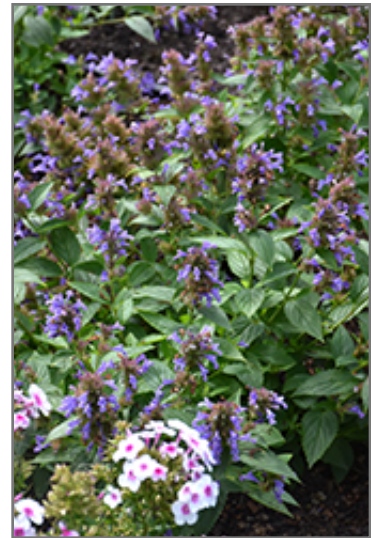
Prelude Blue Catmint flowers

Prelude Blue Catmint is a dense herbaceous perennial with a mounded form. Its relatively fine texture sets it apart from other garden plants with less refined foliage.