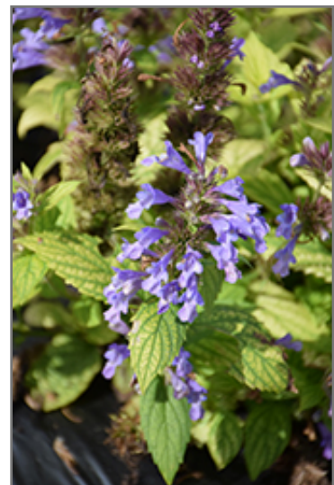
Prelude Blue Catmint flowers