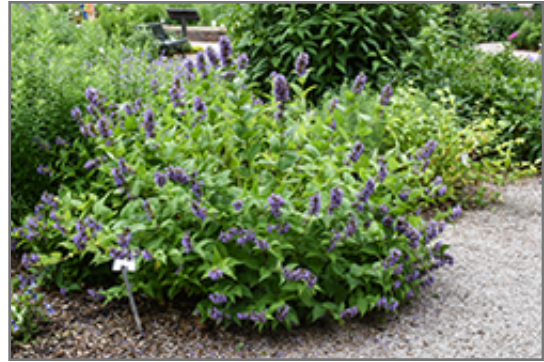
Prelude Blue Catmint in bloom

Prelude Blue Catmint is a fine choice for the garden, but it is also a good selection for planting in outdoor pots and containers. Because of its height, it is often used as a 'thriller' in the 'spiller-thriller-filler' container combination; plant it near the center of the pot, surrounded by smaller plants and those that spill over the edges. It is even sizeable enough that it can be grown alone in a suitable container. Note that when growing plants in outdoor containers and baskets, they may require more frequent waterings than they would in the yard or garden. Be aware that in our climate, most plants cannot be expected to survive the winter if left in containers outdoors, and this plant is no exception. Contact our experts for more information on how to protect it over the winter months.