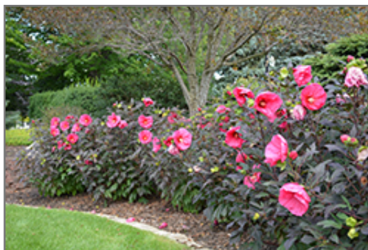
Summerific Evening Rose Hibiscus in bloom