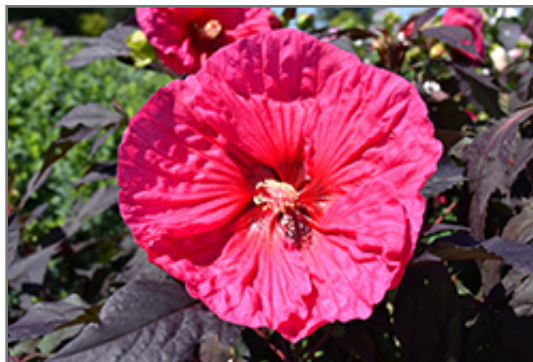
Summerific Evening Rose Hibiscus flowers