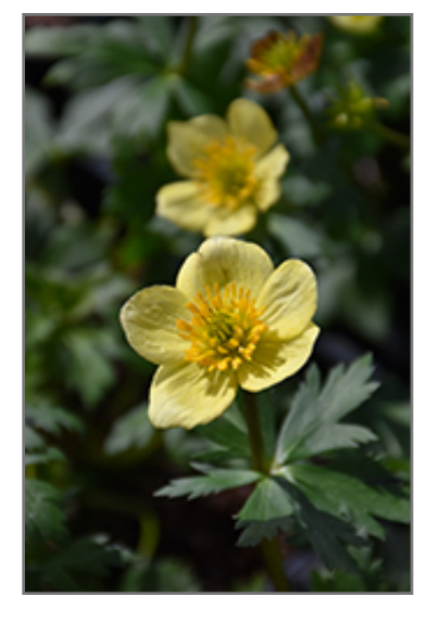
American Globeflower flowers

A wonderful native globeflower presenting cup shaped, pale yellow blooms with numerous golden yellow stamens; use where color is needed in partial shade areas; thrives in boggy soil; a nice addition to a pond or stream margin