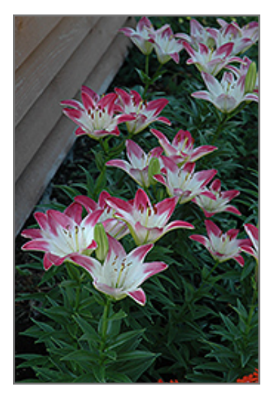
Lollypop Lily in bloom