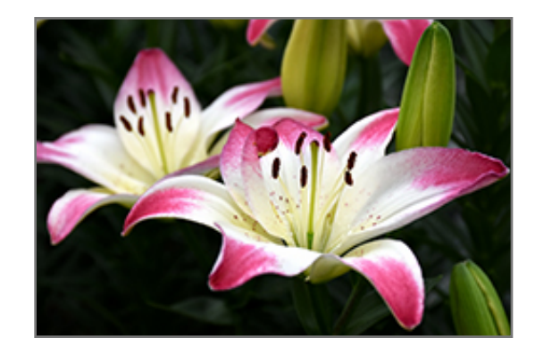
Lollypop Lily flowers