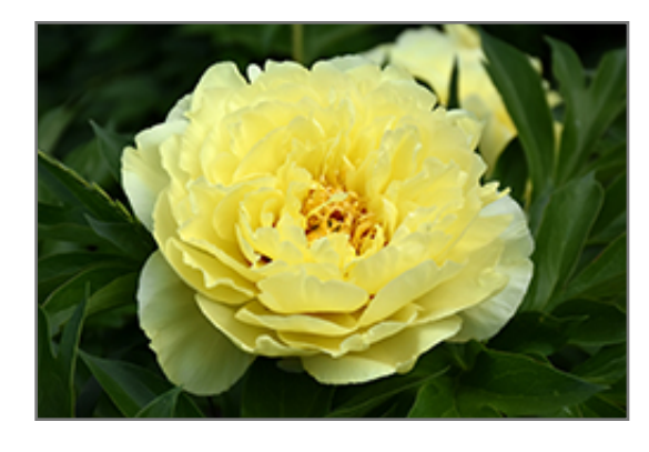
Yellow Crown Peony flowers