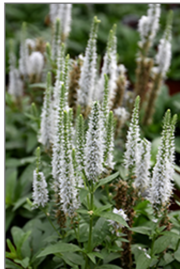
Snow Candles Spike Speedwell flowers