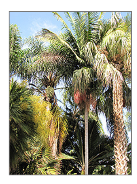
Christmas Palm

This tropical plant does best in full sun to partial shade. It does best in average to evenly moist conditions, but will not tolerate standing water. It is not particular as to soil type or pH. It is somewhat tolerant of urban pollution. This species is not originally from North America.