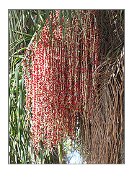
Christmas Palm fruit