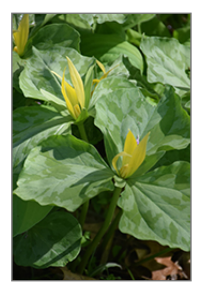
Yellow Trillium flowers