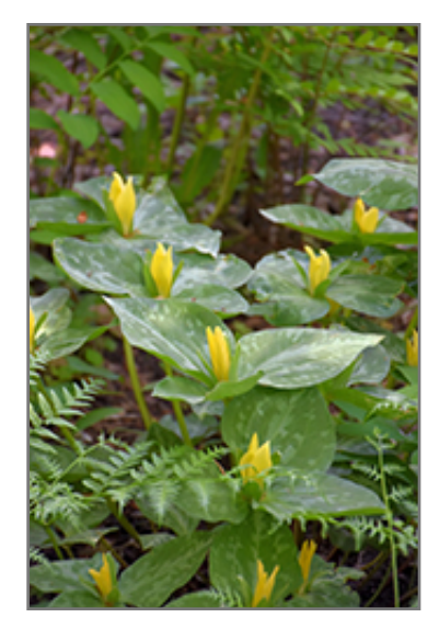
Yellow Trillium flowers