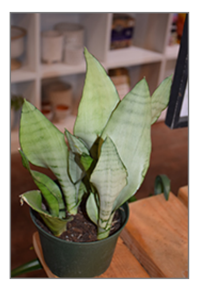
Moonshine Silver Snake Plant in full

This is an herbaceous evergreen houseplant with an upright spreading habit of growth. This plant may benefit from an occasional pruning to look its best.