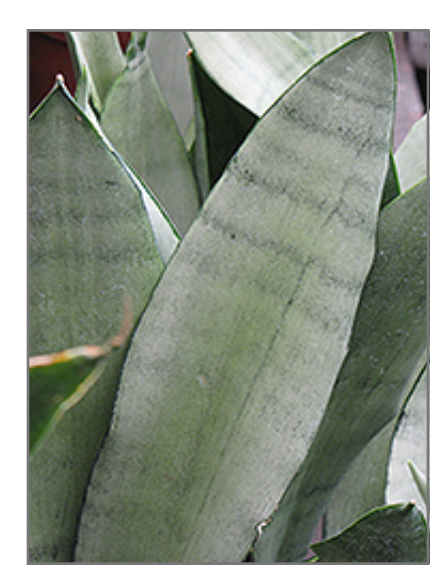
Moonshine Silver Snake Plant foliage