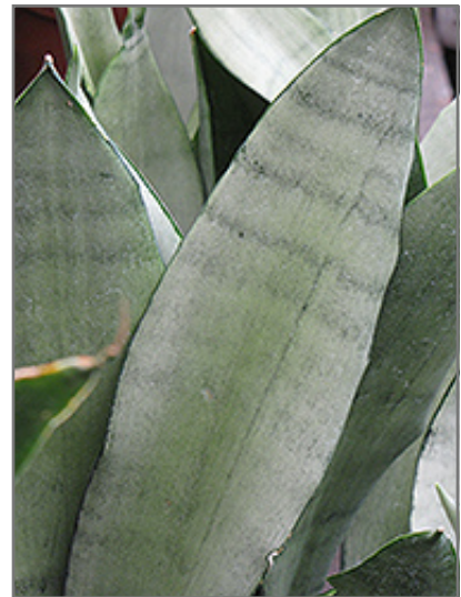
Moonshine Silver Snake Plant foliage