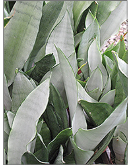
Moonshine Silver Snake Plant

This plant is native to the tropics and prefers growing in moist environments with evenly warm conditions all year round. In our climate, it is usually grown as an outdoor annual in the garden or in a container. If you want it to survive the winter, it can be brought in to the house and provided with special care, and then returned to the garden the following season. In its preferred tropical habitat, it can grow to be around 3 feet tall at maturity, with a spread of 12 inches. However, when grown as an annual or when overwintered indoors, it can be expected to perform differently, and its exact height and spread will depend on many factors; you may wish to consult with our experts as to how it might perform in your specific application and growing conditions.