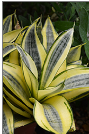
Golden Hahnii Snake Plant

When grown indoors, Golden Hahnii Snake Plant can be expected to grow to be about 8 inches tall at maturity, with a spread of 18 inches. It grows at a slow rate, and under ideal conditions can be expected to live for approximately 10 years. This houseplant performs well in both bright or indirect sunlight and strong artificial light, and can therefore be situated in almost any well-lit room or location. It is very adaptable to both dry and moist soil, but will not tolerate any standing water. The surface of the soil shouldn't be allowed to dry out completely, and so you should expect to water this plant once and possibly even twice each week. Be aware that your particular watering schedule may vary depending on its location in the room, the pot size, plant size and other conditions; if in doubt, ask one of our experts in the store for advice. It is not particular as to soil pH, but grows best in sandy soil. Contact the store for specific recommendations on pre-mixed potting soil for this plant.