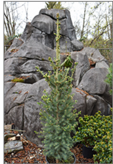
North Pole White Spruce