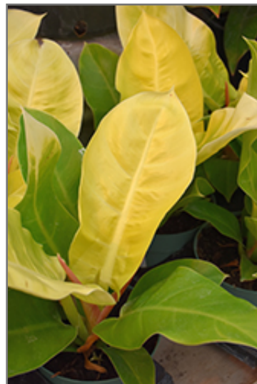
Moonlight Philodendron foliage

When grown indoors, Moonlight Philodendron can be expected to grow to be about 24 inches tall at maturity, with a spread of 24 inches. It grows at a fast rate, and under ideal conditions can be expected to live for approximately 10 years. This houseplant performs well in both bright or indirect sunlight and strong artificial light, and can therefore be situated in almost any well-lit room or location. It prefers to grow in average to moist soil. The surface of the soil shouldn't be allowed to dry out completely, and so you should expect to water this plant once and possibly even twice each week. Be aware that your particular watering schedule may vary depending on its location in the room, the pot size, plant size and other conditions; if in doubt, ask one of our experts in the store for advice. It is not particular as to soil type or pH; an average potting soil should work just fine. Be warned that parts of this plant are known to be toxic to humans and animals, so special care should be exercised if growing it around children and pets.