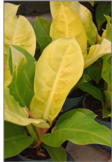
Moonlight Philodendron foliage

This plant does best in partial shade to shade. It prefers to grow in average to moist conditions, and shouldn't be allowed to dry out. It is not particular as to soil type or pH, and is able to handle environmental salt. It is somewhat tolerant of urban pollution. This particular variety is an interspecific hybrid, and parts of it are known to be toxic to humans and animals, so care should be exercised in planting it around children and pets.