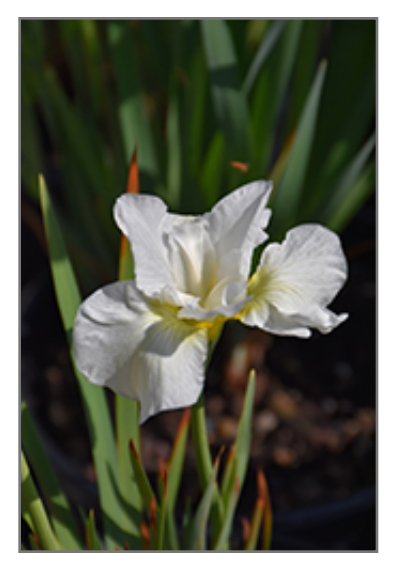
Swans In Flight Siberian Iris flowers

This plant will require occasional maintenance and upkeep, and should be cut back in late fall in preparation for winter. Deer don't particularly care for this plant and will usually leave it alone in favor of tastier treats. It has no significant negative characteristics.