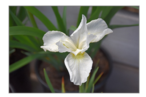
Swans In Flight Siberian Iris flowers

Swans In Flight Siberian Iris is recommended for the following landscape applications;