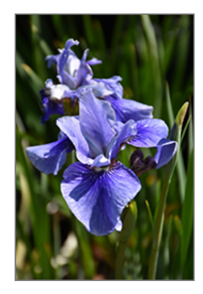
Sky Mirror Siberian Iris flowers