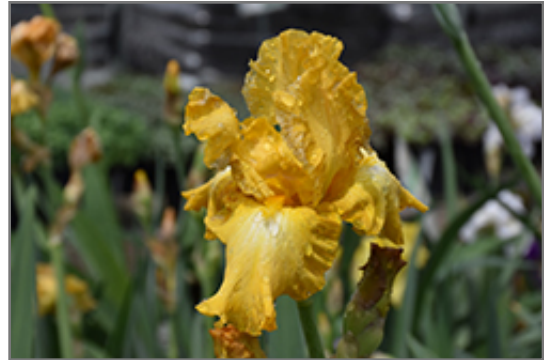
Eggnog Iris flowers