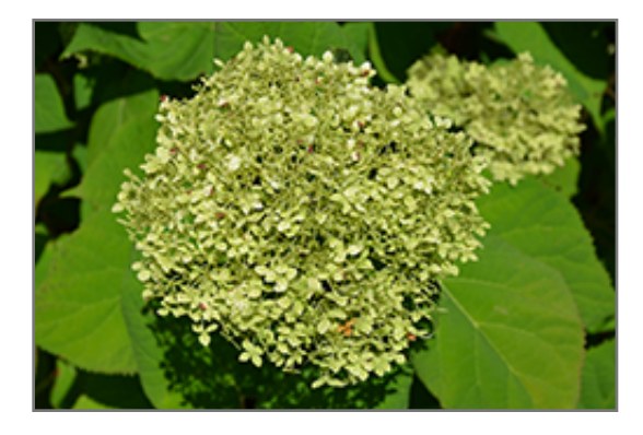
Lime Rickey Smooth Hydrangea flowers (faded)

This shrub does best in full sun to partial shade. You may want to keep it away from hot, dry locations that receive direct afternoon sun or which get reflected sunlight, such as against the south side of a white wall. It prefers to grow in average to moist conditions, and shouldn't be allowed to dry out. It is not particular as to soil type or pH. It is highly tolerant of urban pollution and will even thrive in inner city environments. Consider applying a thick mulch around the root zone in winter to protect it in exposed locations or colder microclimates. This is a selection of a native North American species.