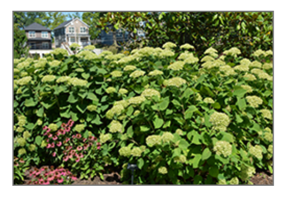
Lime Rickey Smooth Hydrangea in bloom