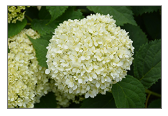
Lime Rickey Smooth Hydrangea flowers