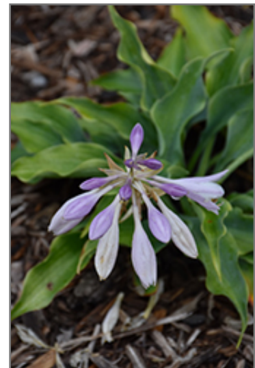
Shadowland Waterslide Hosta flowers