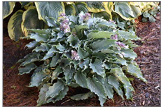
Shadowland Waterslide Hosta