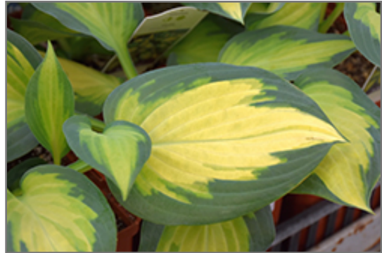
Forbidden Fruit Hosta foliage