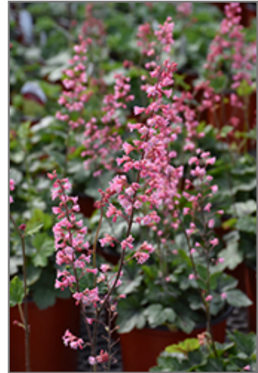
Pink Revolution Foamy Bells flowers

Pink Revolution Foamy Bells is recommended for the following landscape applications;