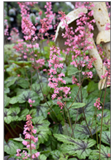
Pink Revolution Foamy Bells flowers