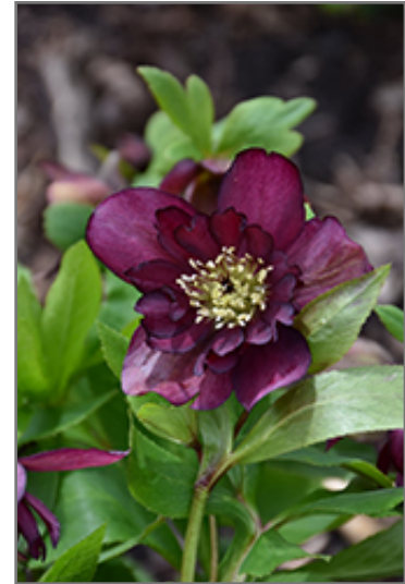
Wedding Party True Love Hellebore flowers