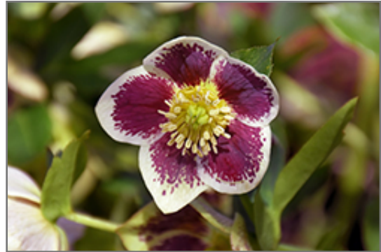
Honeymoon Romantic Getaway Hellebore flowers

Honeymoon Romantic Getaway Hellebore is recommended for the following landscape applications;