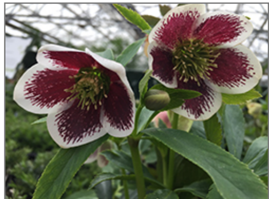
Honeymoon Romantic Getaway Hellebore flowers