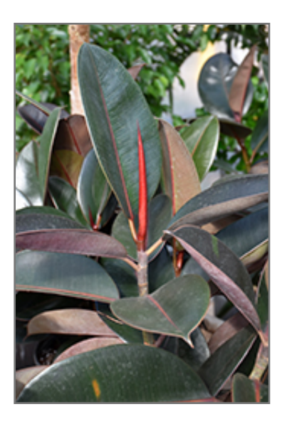
Burgundy Rubber Tree foliage