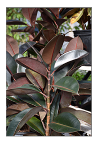
Burgundy Rubber Tree foliage