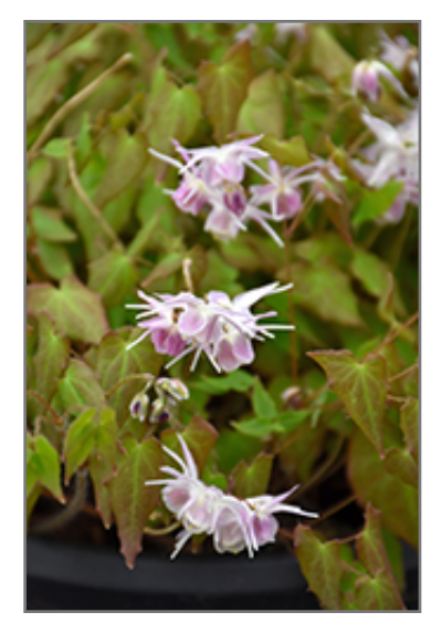
Merlin Barrenwort flowers

Rich violet nodding flowers flushed with white at the base; shield-shaped green leaves have bronze coloring in spring and fall; makes a great groundcover that is tolerant of dry shade once established; also grows well in moisture if well-drained