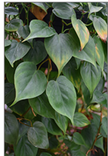
Jade Pothos foliage