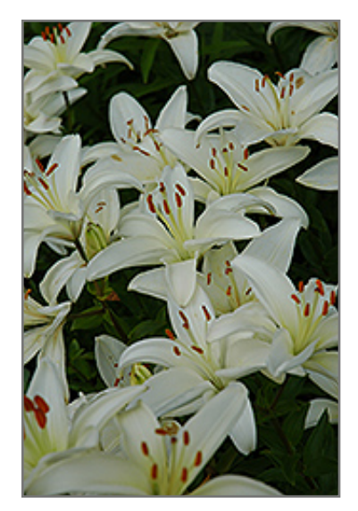
Insell Lily flowers

Insell Lily features bold white trumpet-shaped flowers with buttery yellow throats and orange anthers at the ends of the stems in early summer. The flowers are excellent for cutting. Its narrow leaves remain green in colour throughout the season.