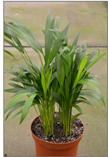
Areca Palm in full

This is a multi-stemmed evergreen houseplant with an upright spreading habit of growth. Its relatively fine texture sets it apart from other indoor plants with less refined foliage. This plant should not require much pruning, except when necessary to keep it looking its best.