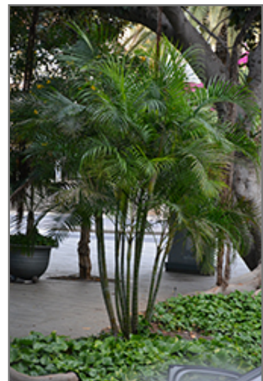
Areca Palm