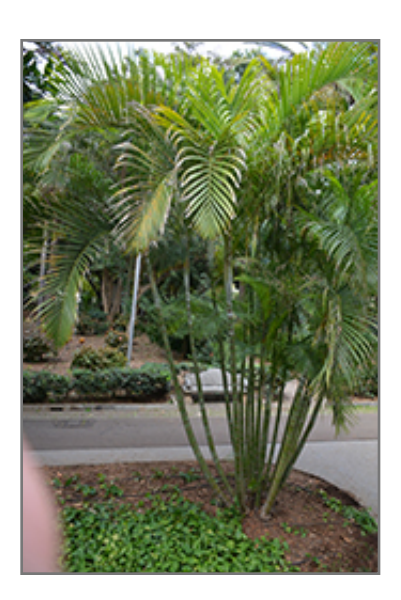
Areca Palm

Areca Palm makes a fine choice for the outdoor landscape, but it is also well-suited for use in outdoor pots and containers. Its large size and upright habit of growth lend it for use as a solitary accent, or in a composition surrounded by smaller plants around the base and those that spill over the edges. It is even sizeable enough that it can be grown alone in a suitable container. Note that when grown in a container, it may not perform exactly as indicated on the tag - this is to be expected. Also note that when growing plants in outdoor containers and baskets, they may require more frequent waterings than they would in the yard or garden. Be aware that in our climate, most plants cannot be expected to survive the winter if left in containers outdoors, and this plant is no exception. Contact our experts for more information on how to protect it over the winter months.