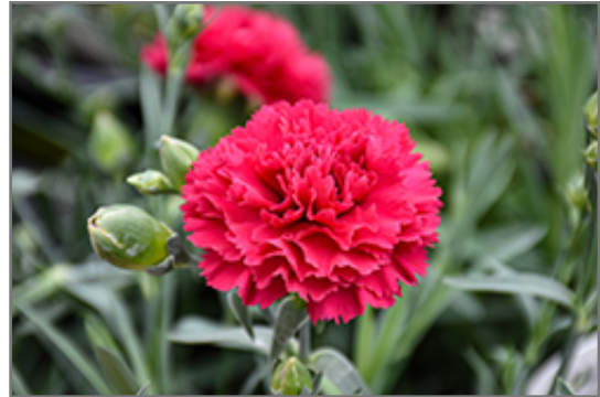
Fruit Punch Cranberry Cocktail Pinks flowers

This is a relatively low maintenance plant, and is best cleaned up in early spring before it resumes active growth for the season. It is a good choice for attracting bees and butterflies to your yard, but is not particularly attractive to deer who tend to leave it alone in favor of tastier treats. It has no significant negative characteristics.