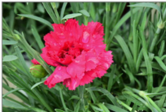
Fruit Punch Cranberry Cocktail Pinks flowers

Fruit Punch Cranberry Cocktail Pinks is recommended for the following landscape applications;