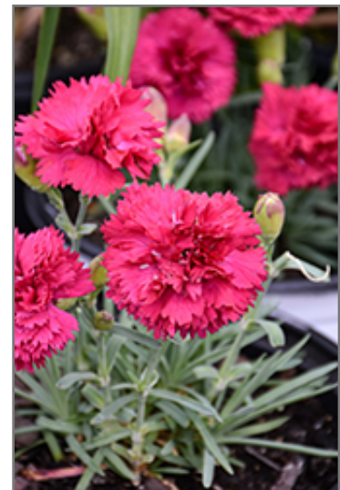
Fruit Punch Cranberry Cocktail Pinks flowers