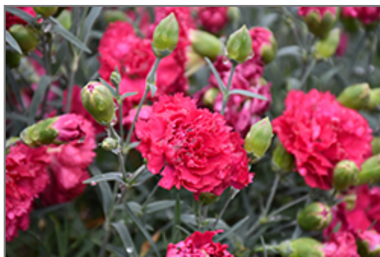
Fruit Punch Cranberry Cocktail Pinks flowers