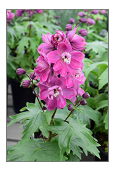
Delphina Rose White Bee Larkspur flowers

Delphina Rose White Bee Larkspur is recommended for the following landscape applications;