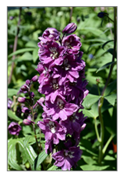
Delphina Rose White Bee Larkspur flowers