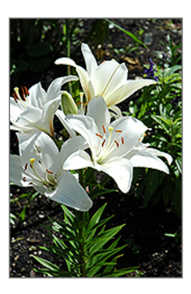
Iceberg Lily flowers

Iceberg Lily features bold white trumpet-shaped flowers at the ends of the stems in mid summer. The flowers are excellent for cutting. Its narrow leaves remain green in colour throughout the season.