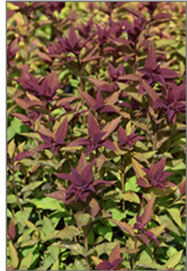
Double Play Doozie Spirea foliage

This shrub should only be grown in full sunlight. It prefers to grow in average to moist conditions, and shouldn't be allowed to dry out. It is not particular as to soil type or pH. It is highly tolerant of urban pollution and will even thrive in inner city environments. This particular variety is an interspecific hybrid.