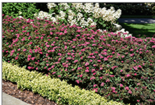
Double Play Doozie Spirea in bloom

Double Play Doozie Spirea is a multi-stemmed deciduous shrub with a more or less rounded form. Its relatively fine texture sets it apart from other landscape plants with less refined foliage.