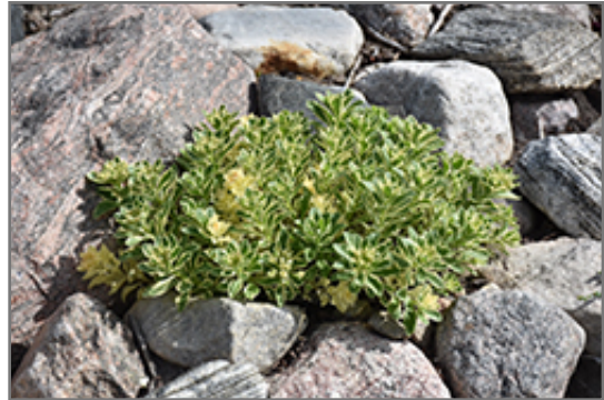
Atlantis Stonecrop