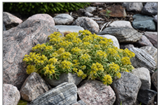
Atlantis Stonecrop in bloom