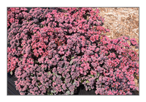
Plum Dazzled Stonecrop in bloom