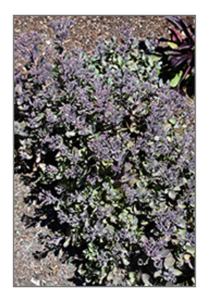
Dynomite Stonecrop in bloom