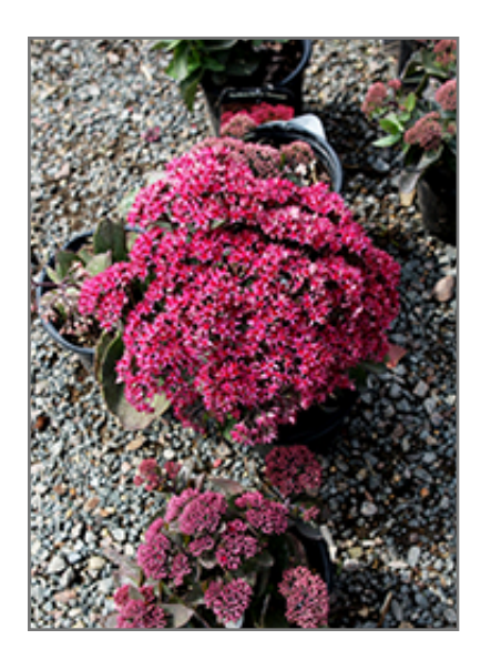
Dynomite Stonecrop in bloom

Dynomite Stonecrop is recommended for the following landscape applications;