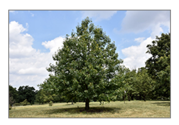
Black Oak

Black Oak is recommended for the following landscape applications;