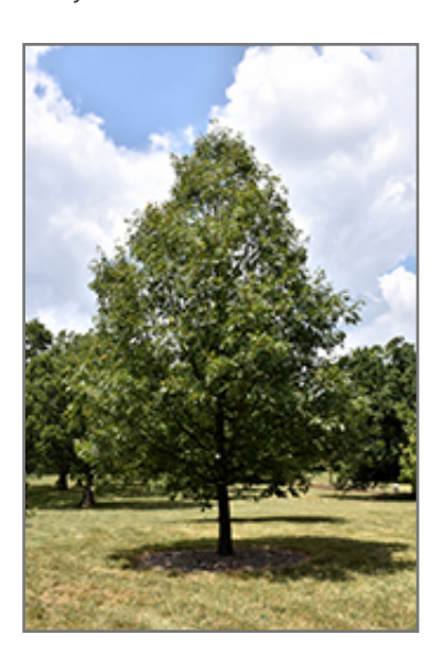
Black Oak