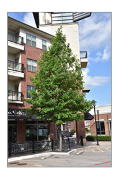
Nuttall Oak