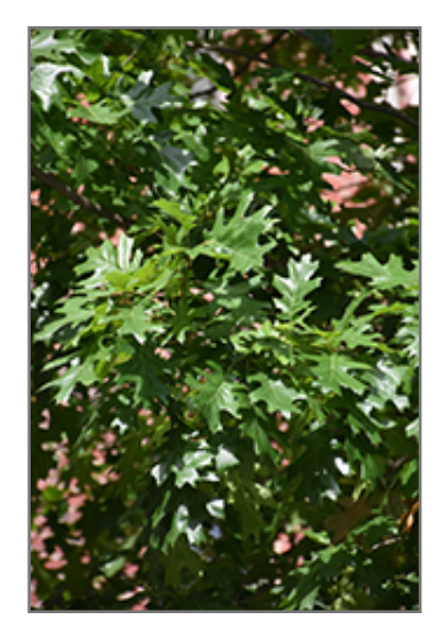
Nuttall Oak foliage