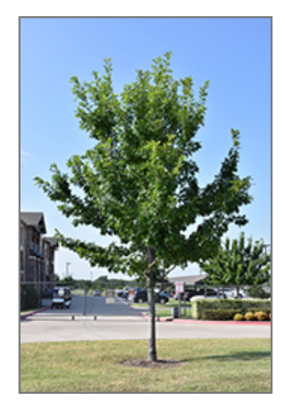
Texas Red Oak