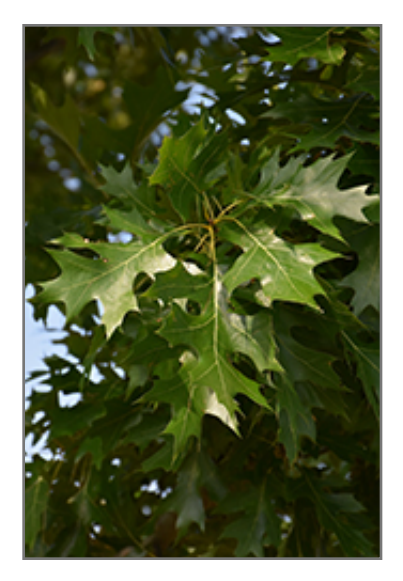
Texas Red Oak foliage

This tree should only be grown in full sunlight. It is very adaptable to both dry and moist locations, and should do just fine under average home landscape conditions. It is not particular as to soil type or pH. It is somewhat tolerant of urban pollution. This species is native to parts of North America.