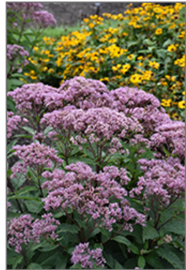
Euphoria Ruby Joe Pye Weed flowers

Euphoria Ruby Joe Pye Weed is an herbaceous perennial with an upright spreading habit of growth. Its wonderfully bold, coarse texture can be very effective in a balanced garden composition.