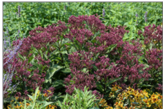
Euphoria Ruby Joe Pye Weed in bloom