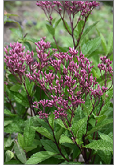
Euphoria Ruby Joe Pye Weed flowers

This plant does best in full sun to partial shade. It prefers to grow in average to dry locations, and dislikes excessive moisture. It is not particular as to soil type or pH. It is somewhat tolerant of urban pollution. This is a selection of a native North American species. It can be propagated by division; however, as a cultivated variety, be aware that it may be subject to certain restrictions or prohibitions on propagation.