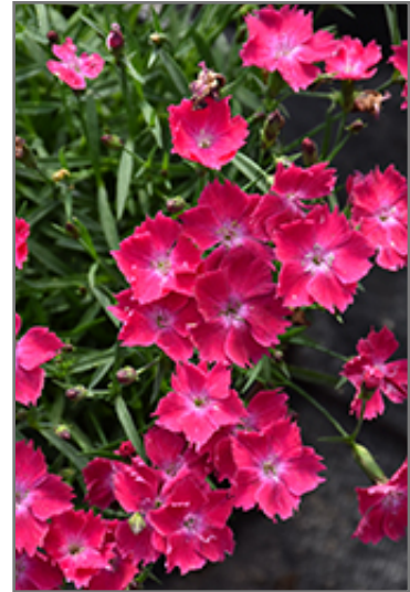
Beauties Kahori Scarlet Pinks flowers

Beauties Kahori Scarlet Pinks is an herbaceous evergreen perennial with a mounded form. It brings an extremely fine and delicate texture to the garden composition and should be used to full effect.