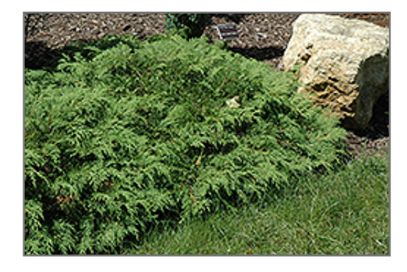
Russian Cypress

Russian Cypress is a multi-stemmed evergreen shrub with a ground-hugging habit of growth. Its relatively fine texture sets it apart from other landscape plants with less refined foliage.