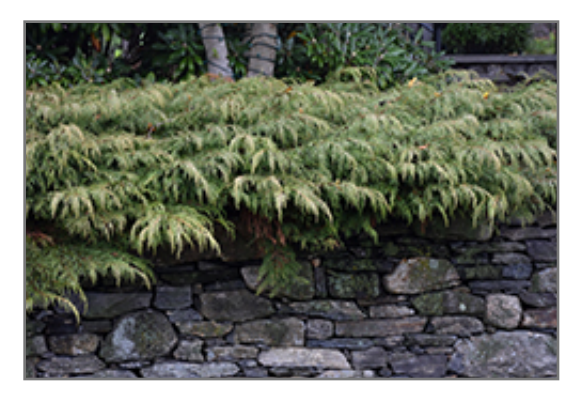
Russian Cypress

This is a relatively low maintenance shrub, and is best pruned in late winter once the threat of extreme cold has passed. It has no significant negative characteristics.